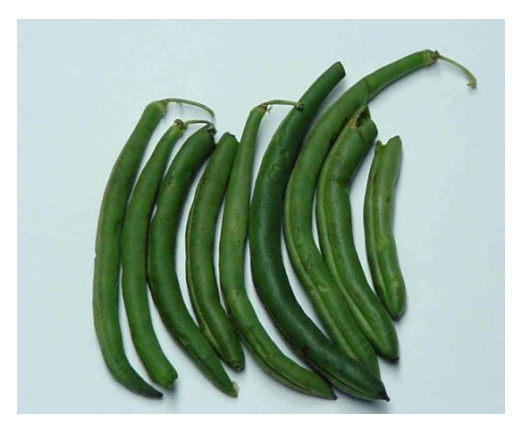
Grocery Store Beans